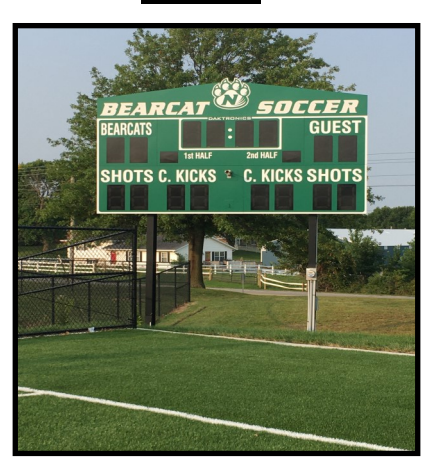
Soccer Field Score Board