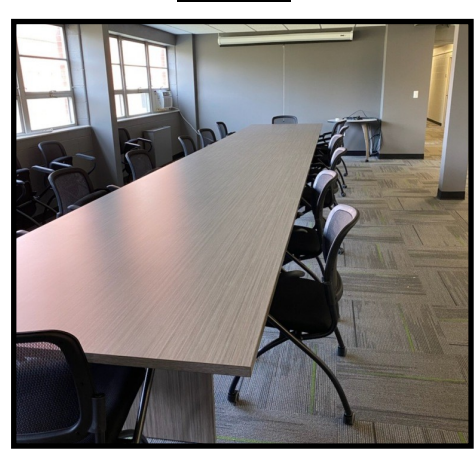
RPDC Conference Room